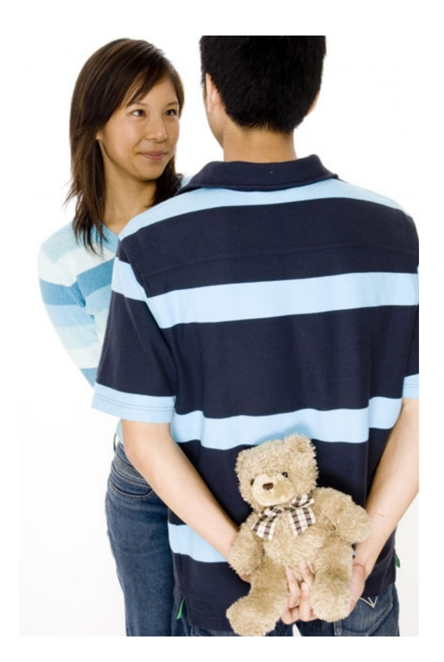
"And How to Make it Right!"